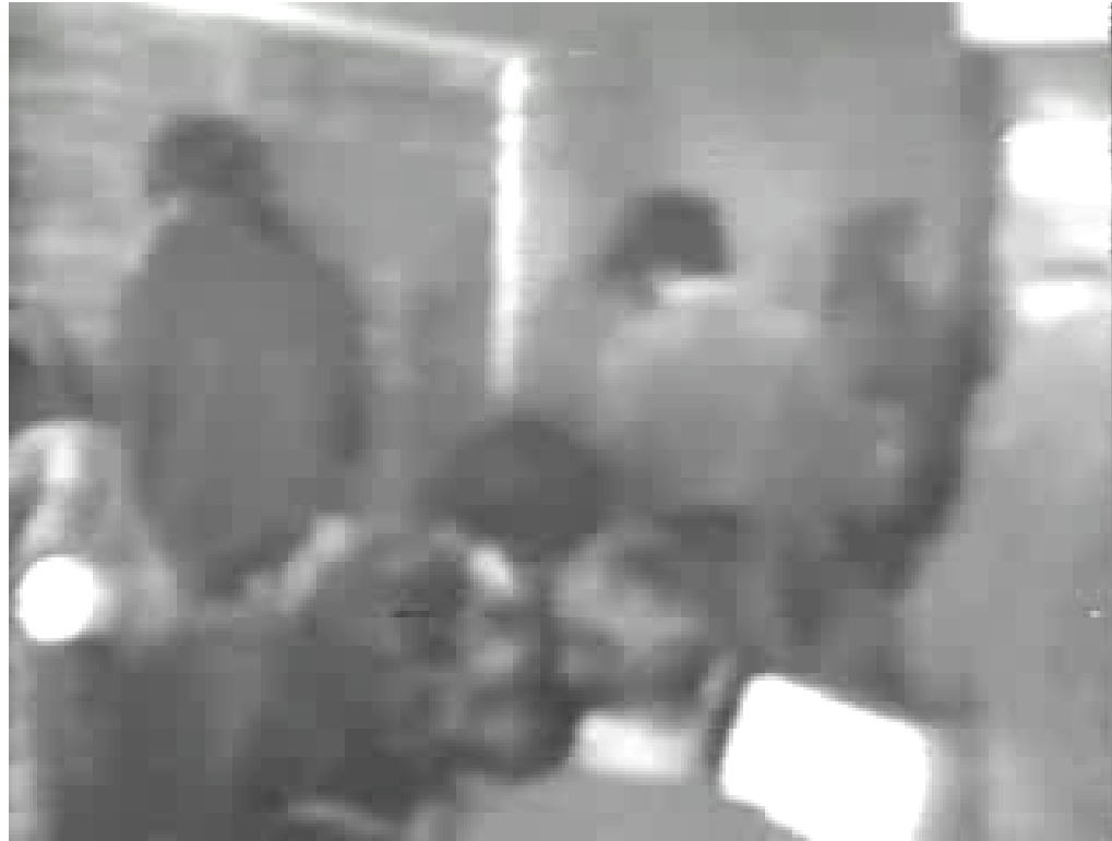
Vincennes Seminar (Paris). 2/3 hours on Tuesdays. 1978-1979. Clip 02' 52"